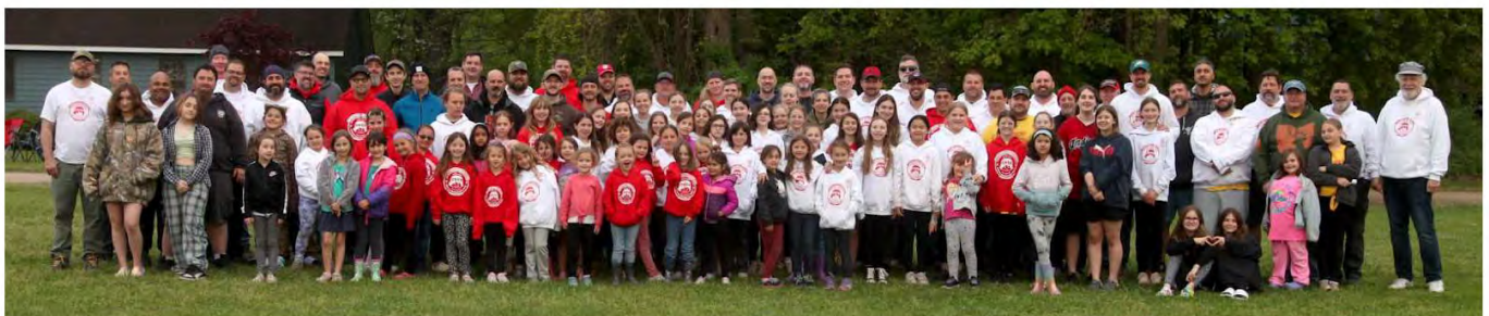
The Big Creek Frontier 2023